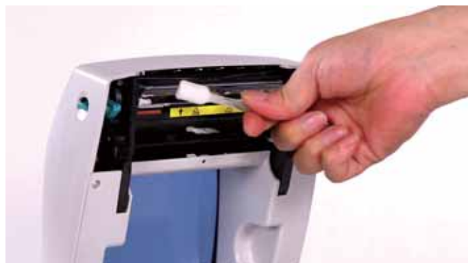
Thermal Print Head Cleaning with Self-saturated Foam Swab