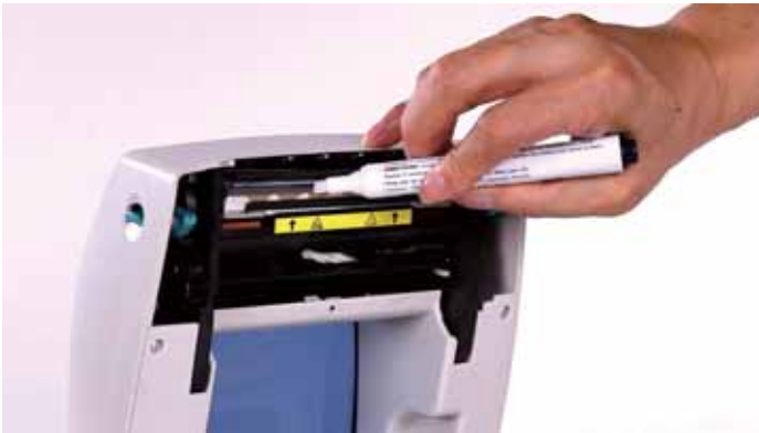
Thermal Print Head Cleaning with Pen

Thermal Print Head Cleaning with Pre-saturated Clean Swab